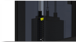
Easy Weight Selection