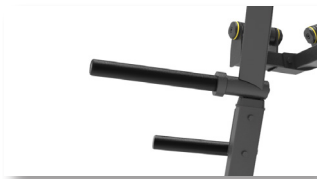
High-Strength weight Horns